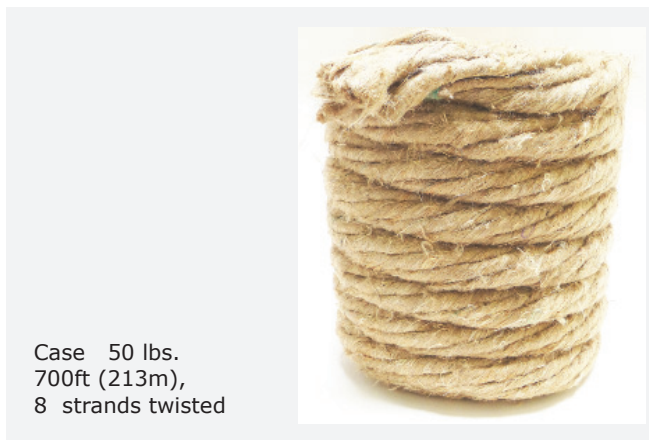
Case 50 lbs. 700ft (213m), 8 strands twisted